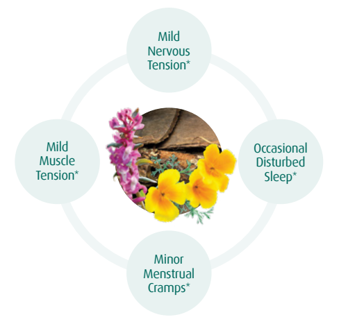
Figure 1: Traditional Health Benefits of MediHerb Nervagesic

Caution: Contraindicated in pregnancy and lactation.